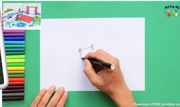
How to draw a kids room

Click here to watch a step by step drawing tutorial on how to draw a kids room! After you watch the tutorial make sure to draw your room! Tell a family member or friend about your room. What items did you add? What colors did you use?